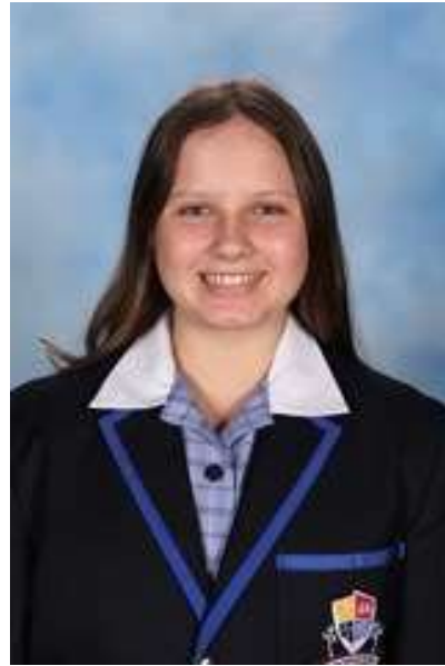
Year 7 at Ashwood High School

Last term I was honoured to be invited to represent Ashwood High School at my primary school, Amsleigh Park Primary School. On the 18 th of September I joined a WebEx call with the students that are starting Year 7 at Ashwood High School next year. I first gave a little introduction of how I felt when transitioning into high school, as well as the things that I struggled with and those I found easier than I had expected.