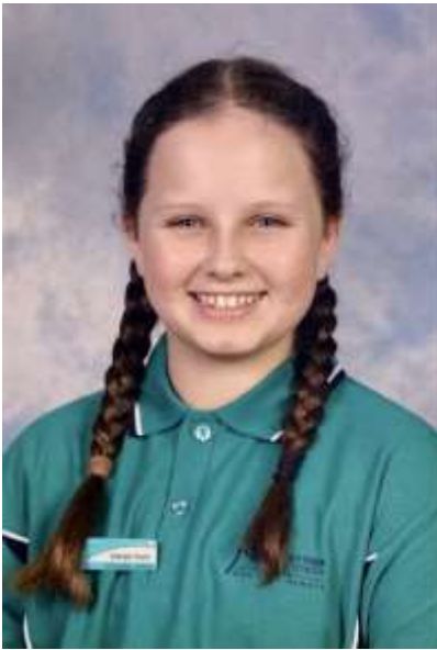
Year 6 at Amsleigh Park Primary School

Article for newsletter: Amsleigh Park Transition