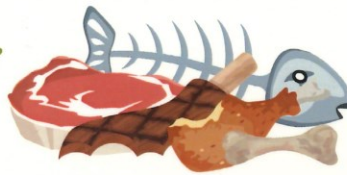
Meat, fish, seafood, bones (raw and cooked)