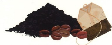
Coffee grounds, tea leaves, tea bags (no labels or staples)