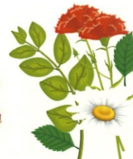
Flowers, plant leaves