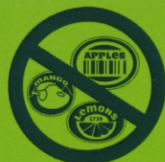
No fruit labels, stickers, rubber bands