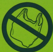
No plastics, food packaging