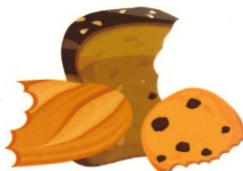
Baked goods, mouldy food