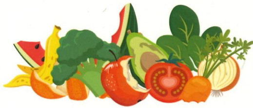
Fruit and vegetable peelings, scraps