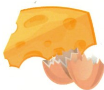
Cheese, dairy, eggshells