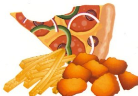
Takeaway foods, fried foods