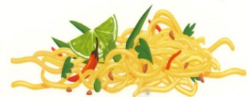
Noodles, pasta, rice, cooked leftovers