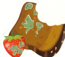
Mouldy, spoiled, out-of-date food